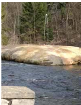
The Healing Waters

Tennis – Hardtop courts and clay courts are free to park visitors.