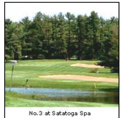
No. 3 at Saratoga Spa

Hiking – Fall, winter and spring outdoor activities make use of several miles of paths and trails winding through the Park.